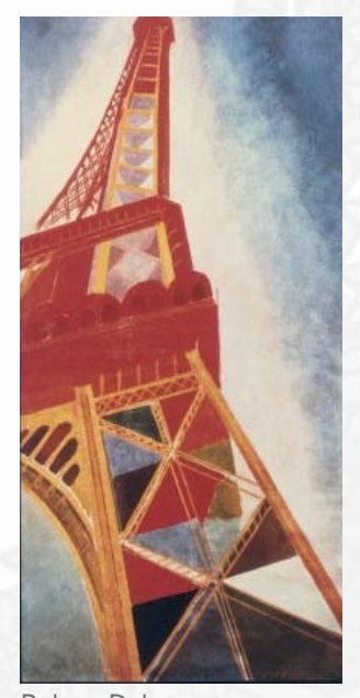
Robert Delaunay « La Tour Eiffel »